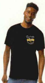
Gildan 5.3 oz. Cotton T-Shirt (G500) BLACK