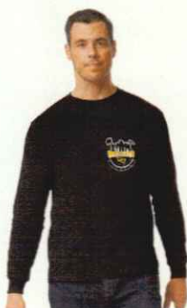
Gildan 5.3 oz. Cotton Long Sleeve T-Shirt (G540) BLACK