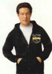
Gildan Heavy Blend 50/50 Full-Zip Hoodie (G186) BLACK