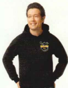
Gildan 5oz. 50/50 Blend Hoodie (G185) BLACK